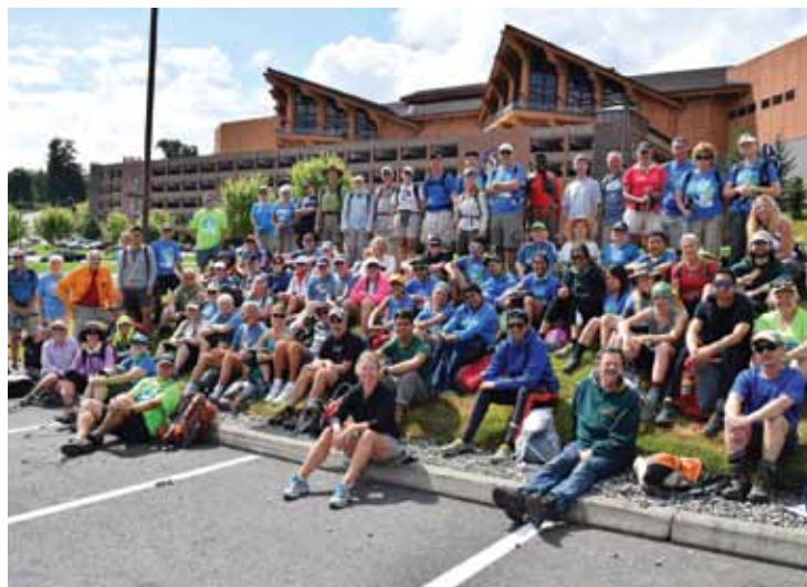
Participants take a break at the casino before continuing on to Seattle.

Mountains to Sound generously invited Snoqualmie Indian Tribe members and staff to participate in a special mid-week hike through Snoqualmie tribal lands beginning at the Traditional Knowledge Trail. Hundreds participated during the weeklong, 100+ mile event.