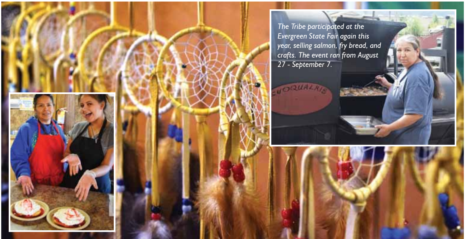
The Tribe participated at the Evergreen State Fair again this year, selling salmon, fry bread, and crafts. The event ran from August 27 - September 7.