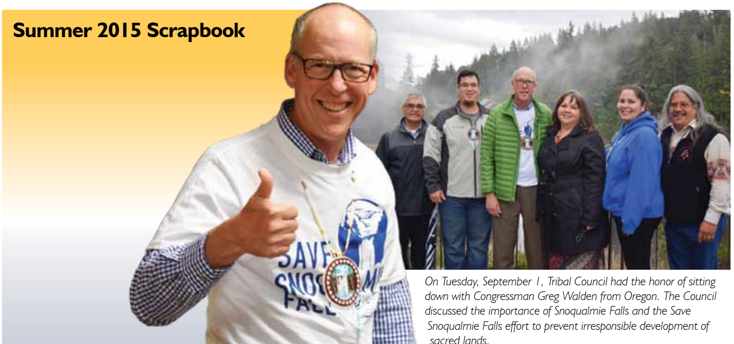
On Tuesday, September 1, Tribal Council had the honor of sitting down with Congressman Greg Walden from Oregon. The Council discussed the importance of Snoqualmie Falls and the Save Snoqualmie Falls effort to prevent irresponsible development of sacred lands.